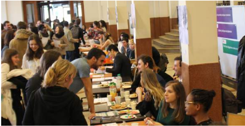
The Annual Masters Fair at the Faculty, Spring 2017

https://www.droit.univ-paris5.fr/ETUDES-ET-FORMATION/MASTERS-2019